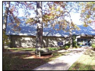
16. Wahtel-Howe Field House

*Located within Middle House: Burnham House Alumni Hall Belmont Gifford Lower East Sinclair Room