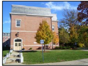
11. Ross House