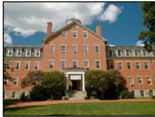
1. Middle House*

*Located within Middle House: Burnham House Alumni Hall Belmont Gifford Lower East Sinclair Room