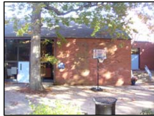
14. Lower School